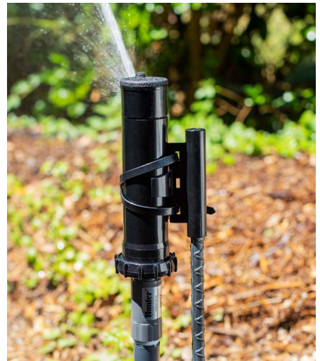
Check Valves Field-installed check valves for laterals or emissions devices.