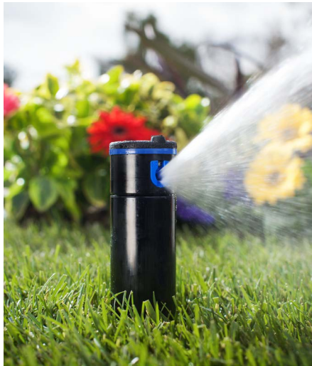
PGP Ultra PRB Rotor Built-in pressure regulation maximizes performance.