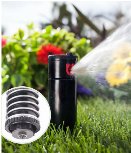
Rotors Factory-installed check valves to save water.