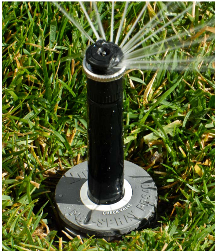
Pro-Spray PRS30 and PRS40 Sprinkler Bodies 30 PSI and 40 PSI regulated heads provide precise inlet pressure.

Allows application devices to work at peak performance and efficiency.