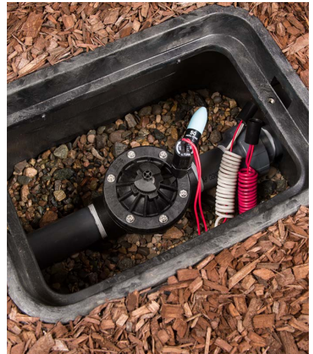
Accu Sync® Pressure Regulator Pressure regulation at the valve ensures downstream efficiencies.