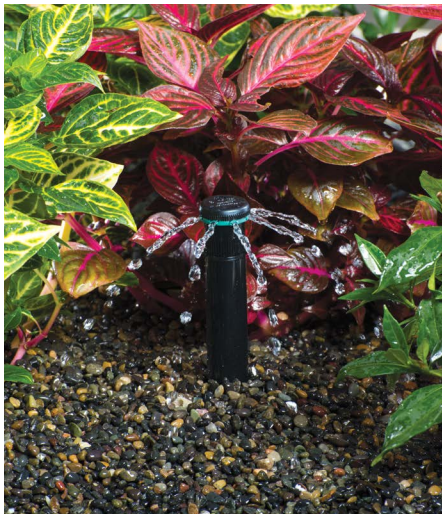
Spray Heads Factory-installed check valves to prevent drainage.

Prevent low-head drainage, landscape damage, and water waste.