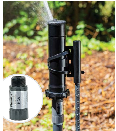
Check Valves Field-installed check valves can be used for laterals or emission devices.