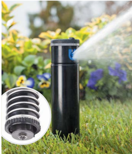
Rotors Factory-installed check valves save water.