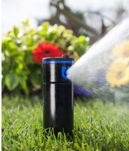
PGP Ultra and I-20 PRB Rotors Built-in pressure regulation in the rotor body maximizes performance.