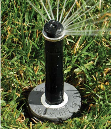
Pro-Spray PRS30 and PRS40 Sprinkler Bodies 30 PSI and 40 PSI regulated heads provide precise inlet pressure.

Allows application devices to work at peak performance and efficiency.