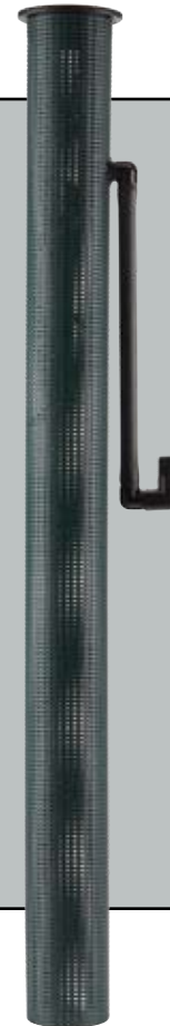
36" (0.9 m) RZWS