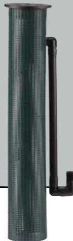
18" (0.46 m) RZWS