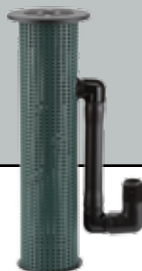
10" (0.25 m) RZWS

If you want young plants and trees to thrive, start 'em out right. Using both near-the-surface and deep root watering encourages roots to grow deep and stay safely below the surface. The equation is simple: water + oxygen + vital nutrients = healthy root systems. Developed to meet this challenge, the RZWS Root Zone Watering System features Hunter's patented StrataRoot design. It's a series of internal baffles that delivers water where it's needed most. Design also lends rigidity to the irrigation cylinder to facilitate installation. Comes pre-assembled to save time. Better still, the enclosed design and grate protect irrigation hardware from vandalism. To find the right solution, sometimes you just have to dig deep.